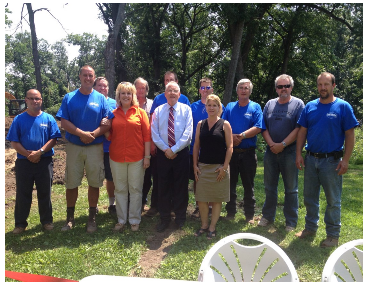
Workers and supporters pose for one final picture at the Brace home in Janesville