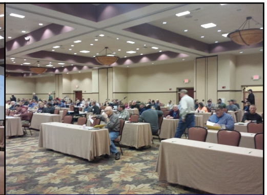
Attendees Listening Intently and Gaining Valuable Info!