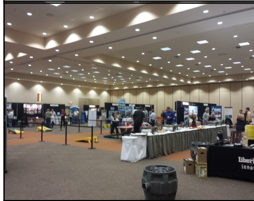
Attendees Talking Industry & Products in Exhibition Hall