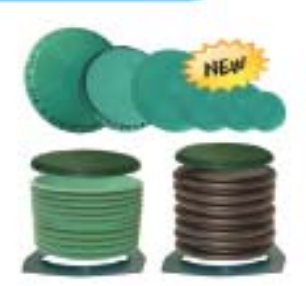
12", 15", 18", 24" & 30" Heavy Duty Covers for corrugated / ribbed pipe