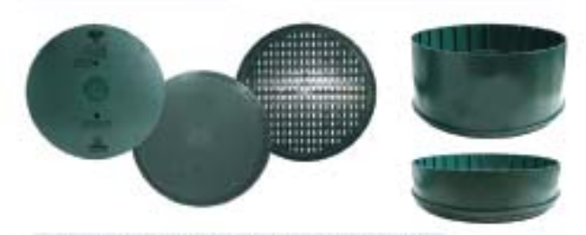
Septic Tank Risers, Covers & Grates