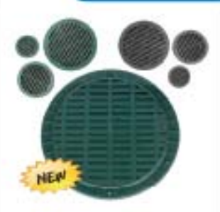
3", 4", 6", 12", 15", 18" & 24" Heavy Duty Grates for corrugated / ribbed pipe